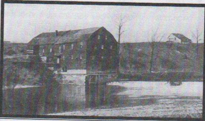
The old mill stood on Big Raccoon Creek near Armiesburg in Parke county, Indiana. William Henry Harrison encamped here with his troops on the way to the Battle of Tippecanoe in 1811.

associated with them in a very extensive way in the town. During these years the firm shipped many bushels of wheat via the Wabash & Erie Canal.