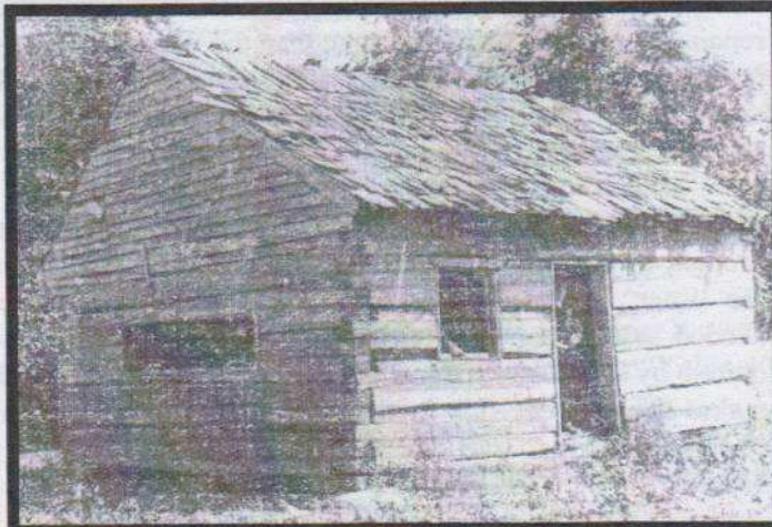
"Litsey" School built 1844