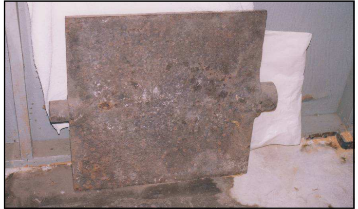
Above: This wicket gate from the Wabash & Erie Canal in Parke county, Indiana was in the Indiana Museum Warehouse in Indianapolis.

The Wabash and Erie Canal began construction through Parke county in 1844. Some of the articles made at Foundry were wickets for the aqueducts, locks and feeder dam as well as other iron fixtures for them.