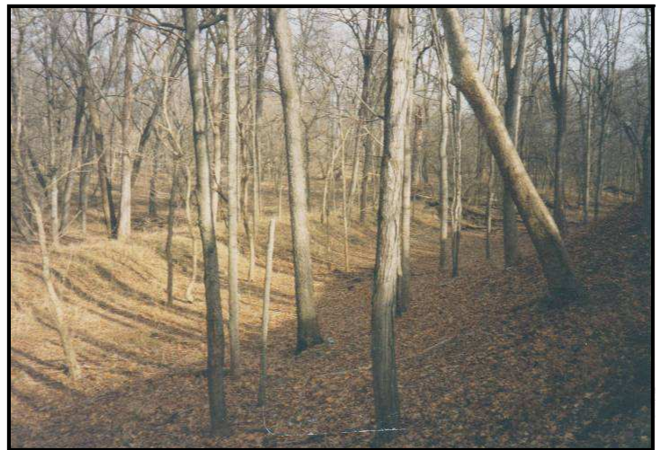
Below: This feeder canal from the Feeder Dam on Sugar Creek is heading to West Union to join the Wabash & Erie Canal. It is nearing the bluff and getting narrower.