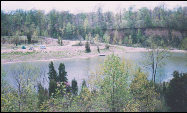
Coke Oven Hollow in Parke county, Indiana in 1991 is seen on the map on the previous page.