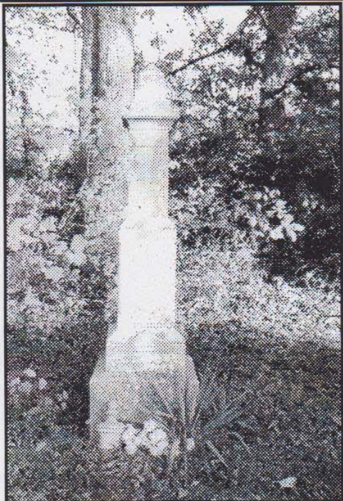
Christopher's stone has HAMMAN across its bottom and the broken off urn sits at its base. On the back facing the tree line it reads: