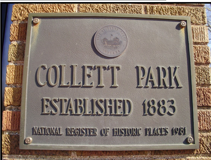
Collett Park, established in 1883, today is surrounded by beautiful old homes. It was placed on the National Register of Historic Places in 1981.