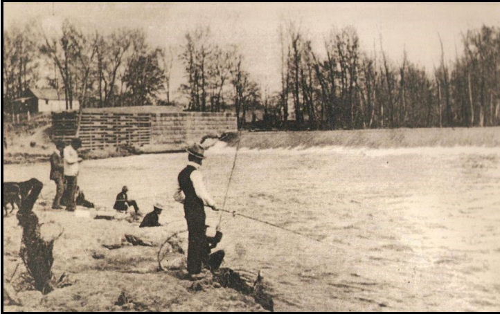
Grand Rapids Dam on the Wabash River—historic photo

small frame buildings, one of which was used as an office for the lock-tender (probably Joseph C. Hurd's office). They thought that while rebuilding the lock the buildings could be used for a superintendent's office and later, when the project was completed, as a residence for the lock-tender.